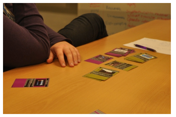
Figure 6. Brainstorming 3: Interacting with Challenge Cards.

The final brainstorming session happened on day 4 of the workshop and lasted 25 minutes. Students were given the "missing" Challenge Cards and were asked to find holes and potential problems applicable to their current designs. In addition they were encouraged to make good use of the blank cards to write down any additional major challenges they might be facing (Figure 6).