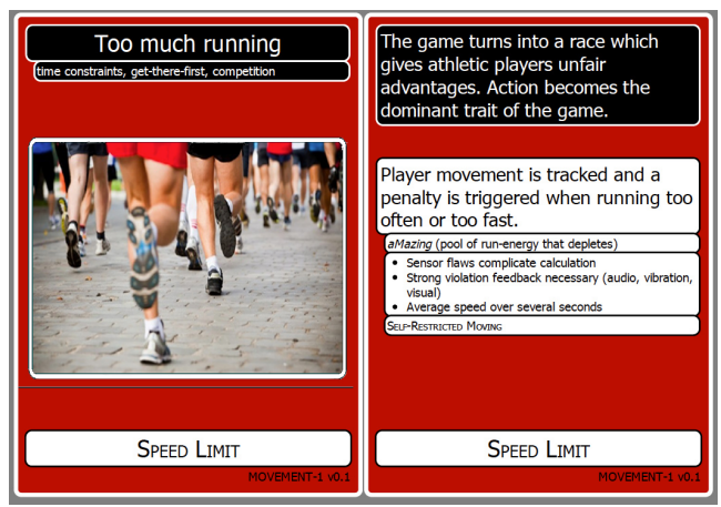
Figure 2. Prototype with basic information on the front (left) and more details on the back (right).

Several different cards in these four combinations were then shown to a small group of researchers that had previous experience with creating Mixed Reality games. At this stage the