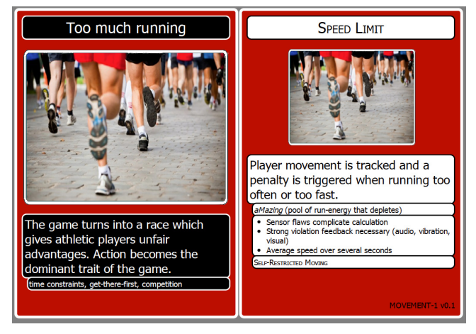
Figure 1. Prototype separating problem (left) and solution (right).

The first two prototypes were developed in parallel. One dedicated one side to the solution and the other to the problem (Figure 1), while the other one created one side as a quick overview and the other one with more detailed information (Figure 2). Both versions were printed in two different sizes each: 15cm x 10cm and 11.5cm x 8cm respectively.