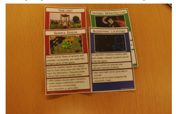
Figure 4. Brainstorming 1: Final selection of Opportunity Cards for one game design.

These restricting rules were mainly in place for the following reasons: a) ensuring that all students got to voice their opinions, b) limiting the games to a small set of core, defining features.