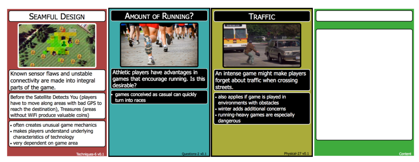
Figure 3. a) Opportunity Card "Seamful Design", b) Question Card "Amount of Running?", c) Challenge Card "Traffic", d) Blank Opportunity Card.

Bad Content, Battery Life, Complex Interface, Effortful Testing, GPS and AR, GPS and Buildings, Orientation Loss, Unengaging AR, Unreliable Sensors, Unstable Connectivity.