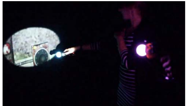
Figure. 1: The projected augmented reality game The Rooms .

Projected augmented reality – casting images from projectors onto objects while maintaining correct perspectives – is a developing technology that allows multiple people to experience the same imagery without wearing any form of glasses. This paper describes the development of The Rooms - a collaborative horror game. This was developed as a case study to explore how projected augmented reality can support collaborative immersive