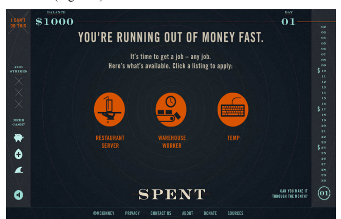
Figure 1. Spent opening title screenshot

Spent is a text based game developed by the McKinney advertising studio in cooperation with the Durham Homeless Coalition. The player starts off with a scenario that they are a single parent, have no job, and just lost their home. The gameplay starts when the player is challenged to see if they could survive on $1000 for the next month. After securing a job the player is faced with a series of choices including finding housing, paying for car insurance, joining the union, and buying food. Every decision has an effect on the player's money barometer and the challenge is to make the choices you would normally make in your own life but on the limited financial means that the player currently has available (Figure 1).